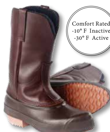
OUTFITTER PULL-ON T/T

Comfort Rated -10° F Inactive -30° F Active