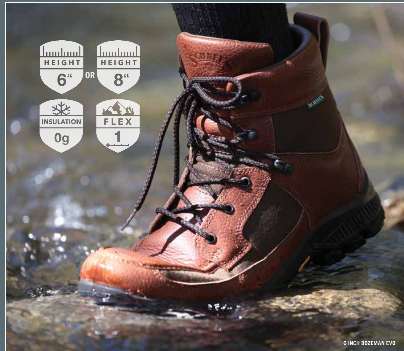
6 INCH BOZEMAN EVO

Brown. 8" height. 3lbs. 9.5oz. Medium 7-12, 13, 14. Wide 8-12, 13, 14. SCW-830BRN \ $339