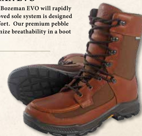
8 INCH BOZEMAN EVO

Mid: 6 inch. 7.5-13, 14, 15. 3lbs. 2oz. Chestnut. Slovenia. SCW-886 \ $329